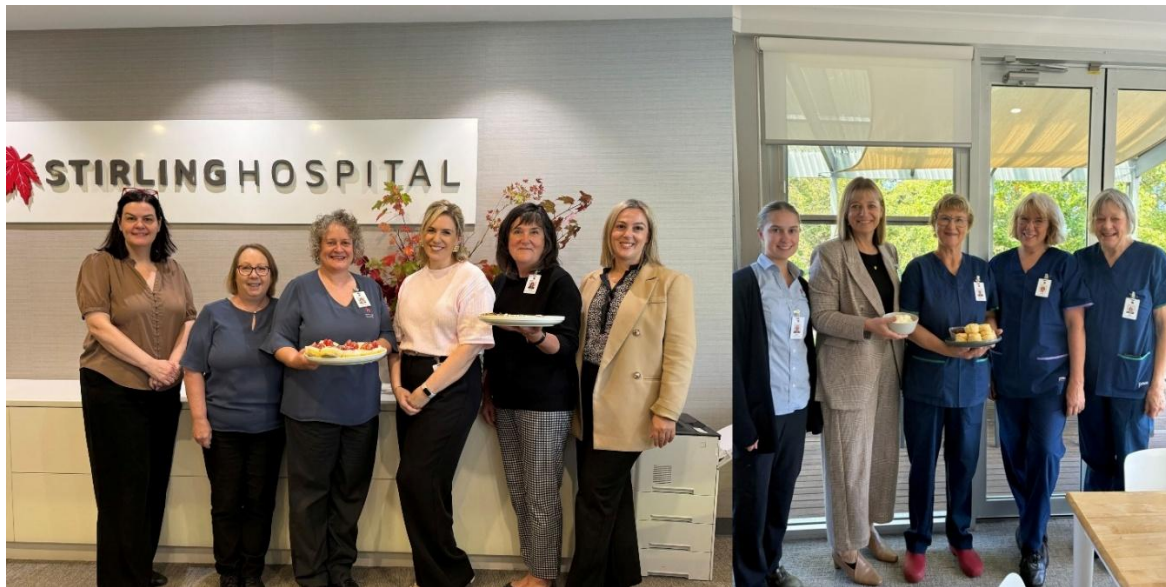
Celebrating Administrative Professionals Day and International Nurses Day with morning tea.

We again had strong hand-hygiene results for the Hospital this quarter, something we take great pride in. We have also been working on our new Strategic Plan which will be released to the public soon. Keep an eye out on our website and socials for details - and as always, in between newsletters, our Facebook and Instagram pages are always a great way to stay engaged in our news. Follow along. Lots of exciting things to share this quarter. Enjoy.